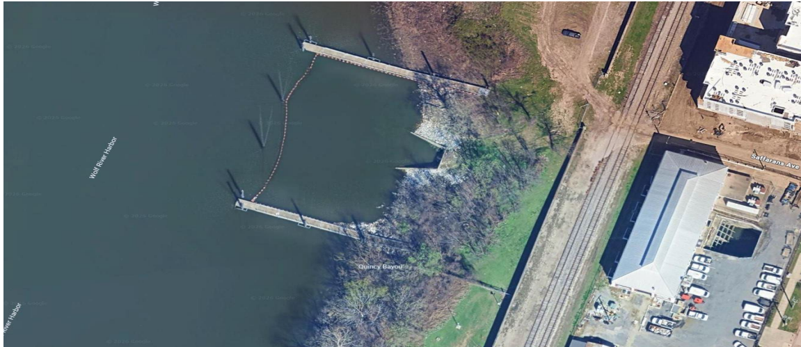
Gayoso Bayou Pumping Station Concrete Culvert