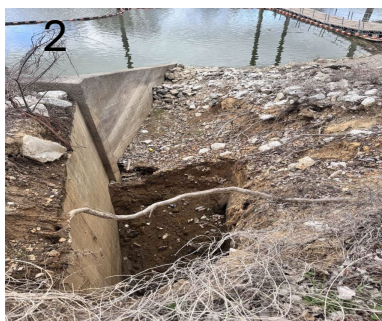
2 & 3 Erosion behind the Right Wing Wall and outside the Wall of the Box.