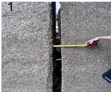
1. 3-1/2 in. Spacing between Barrel Wall and Wing Wall