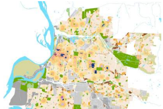
If the code update aligns the zones with the land use designations, the UDC will be better prepared to incorporate policy direction from Memphis 3.0.

Remap zoning districts to correspond with the new land use designations of Memphis 3.0. Appropriate selection of zones can be informed by small area plans, the Degree of Change Map in Memphis 3.0, and surrounding context. If the code update aligns the zones with the land use designations, the UDC will be better prepared to incorporate policy direction from Memphis 3.0.